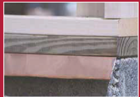
YorkShield 106 TS copper flashing won't corrode with ACQ treatment