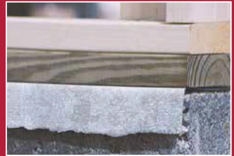
ACQ treatment corrodes aluminum flashing

Since January 1, 2004, the EPA has mandated that pressure-treated lumber be arsenic-free. But the ACQ treatment replacing arsenic-based chemical preservatives contains a higher level of copper... causing a galvanic reaction that will corrode, degrade, and destabilize the integrity of aluminum flashing. That's why you need YorkShield 106 TS™