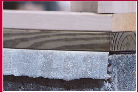
ACQ treatment corrodes aluminum flashing

Since January 1, 2004, the EPA has mandated that pressure-treated lumber be arsenic-free. But the ACQ treatment replacing arsenic-based chemical preservatives contains a higher level of copper... causing a galvanic reaction that will corrode, degrade, and destabilize the integrity of aluminum flashing. That's why you need YorkShield 106 TS™.