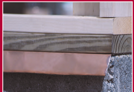
YorkShield 106 TS copper flashing won't corrode with ACQ treatment