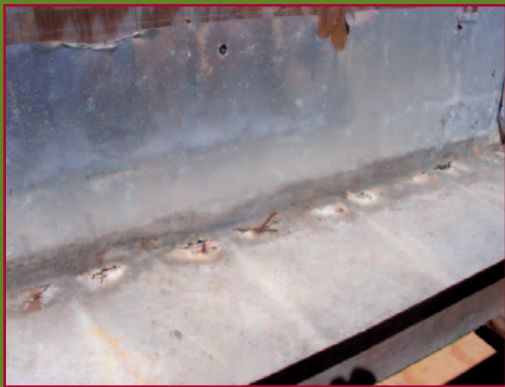
New treatments will corrode aluminum and galvanized flashings