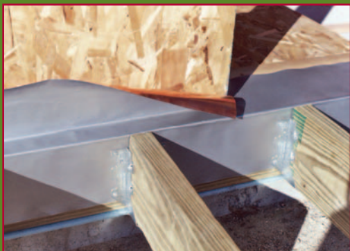
YorkShield 106 PT copper flashing will not corrode when in contact with new wood treatments provided a lifetime flashing solution.